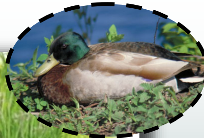
Example Diagram of a Wildlife Pond