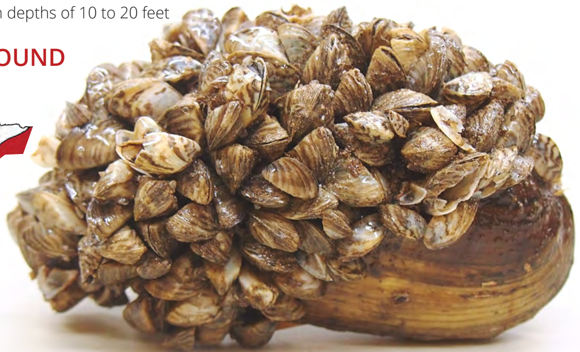
Zebra mussels covering native mussel