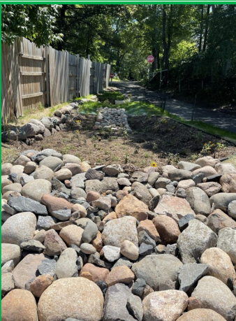
Rock inlet and overflow to slow water.