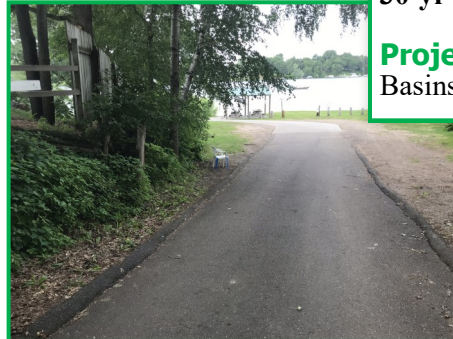
Cobalt Circle draining towards the lake.