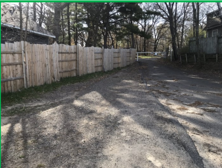
Direct path for runoff into lake.