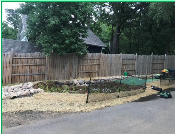
450 square-foot rain garden installed June 2021