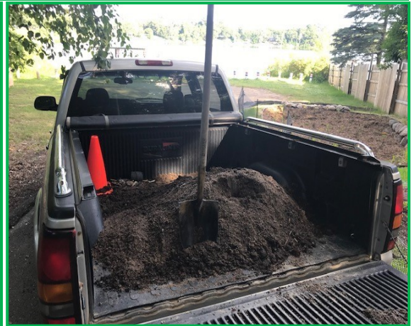
Sediment captured in pre-treatment chamber after first 1” rain event.

Isanti Soil and Water Conservation District 110 Buchanan St. North Cambridge, MN 55008 763-689-3271 www.IsantiSWCD.org