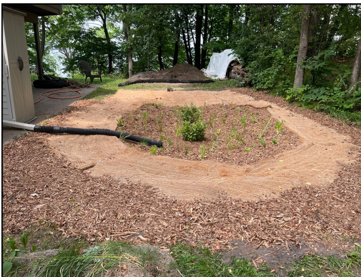
108 sqft raingarden installed to capture and filter rainwater runoff.