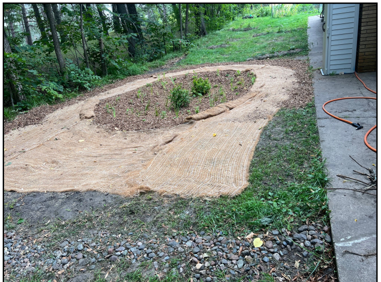
100 native plant plugs installed to stabilize soil and capture nutrients.