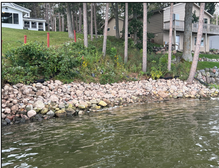
40 in/ft of shoreline stabilized using rock and native vegetation.