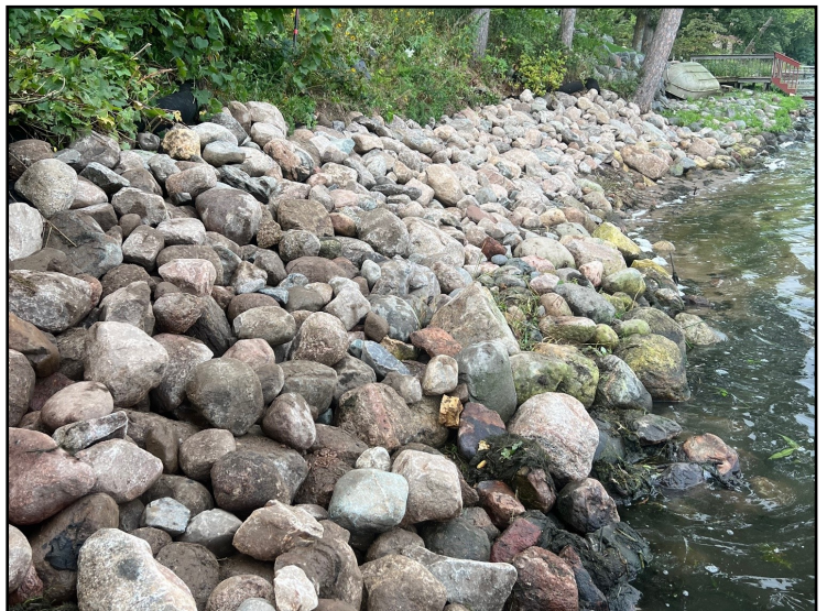
Rock used to armor the shoreline during extreme weather events that are common to Green Lake.