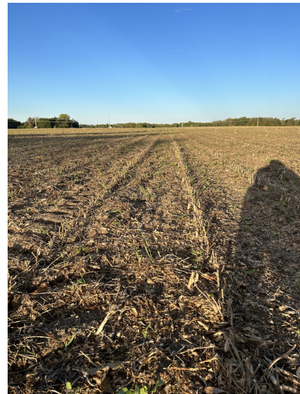
Cover crops growing in a field. October 10th.