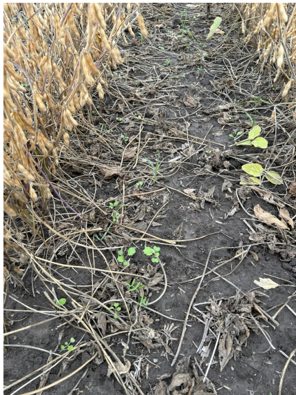
Cover crops growing in a field. September 28th.