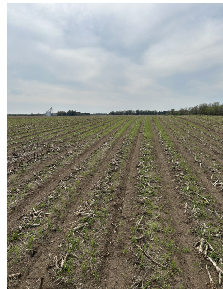
Cover crops growing in a field. May 10th.