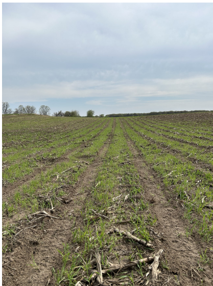
Cover crops growing in a field. May 10th.