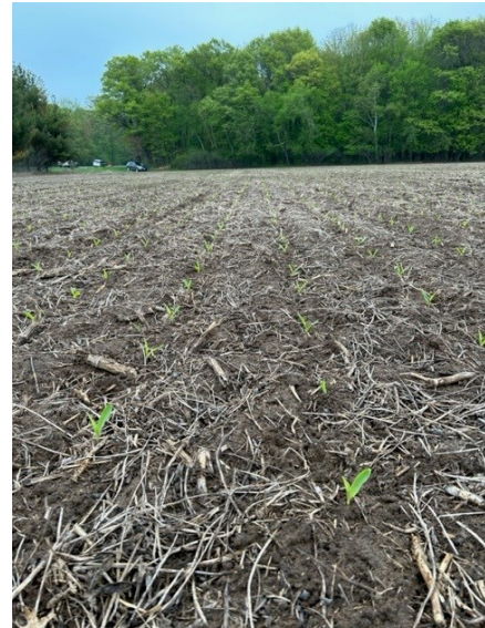
No Till field. Taken 5/18/2023