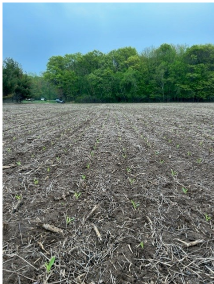
No Till field. Taken 5/18/2023