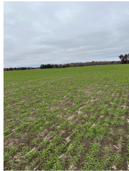
Cover crops growing in a field. Taken 11/7/2023