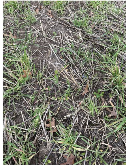
Cover crops growing in a field. October 18th