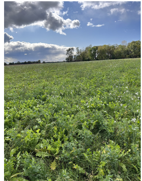
Cover crops growing in a field. October 6th.