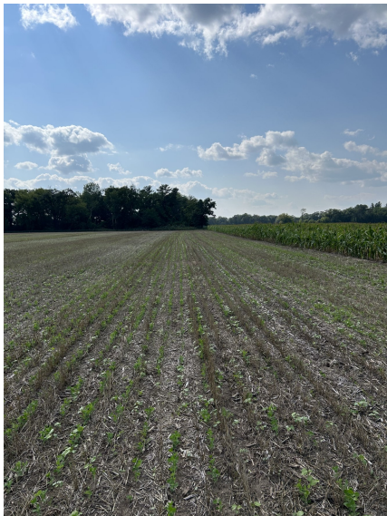
Cover crops growing in a field. August 17th.