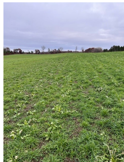
Cover crops growing in a field. November 7th