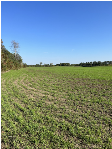
Cover crops growing in a field. October 2nd