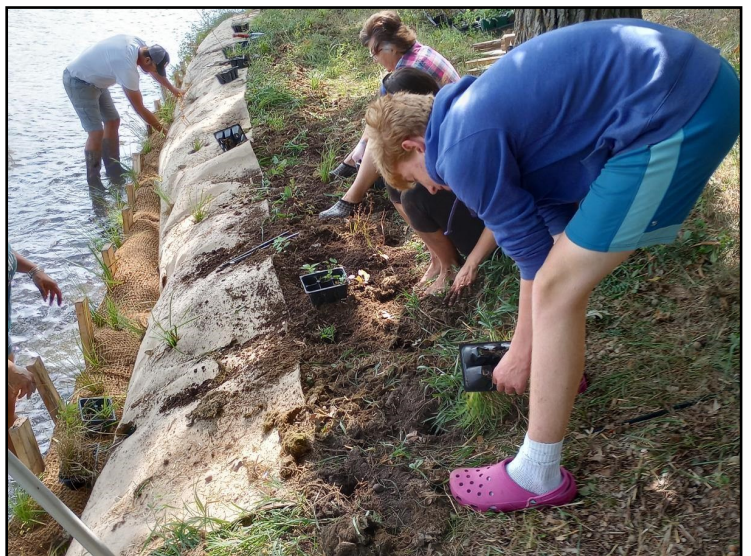
500 sqft native plant buffer installed to capture rainwater runoff.