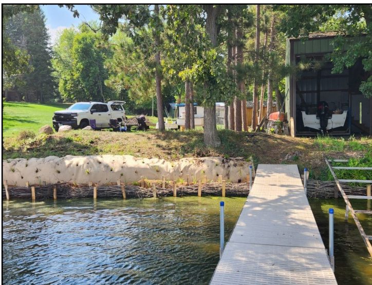
50 lft of shoreline stabilized to reduce shoreline erosion