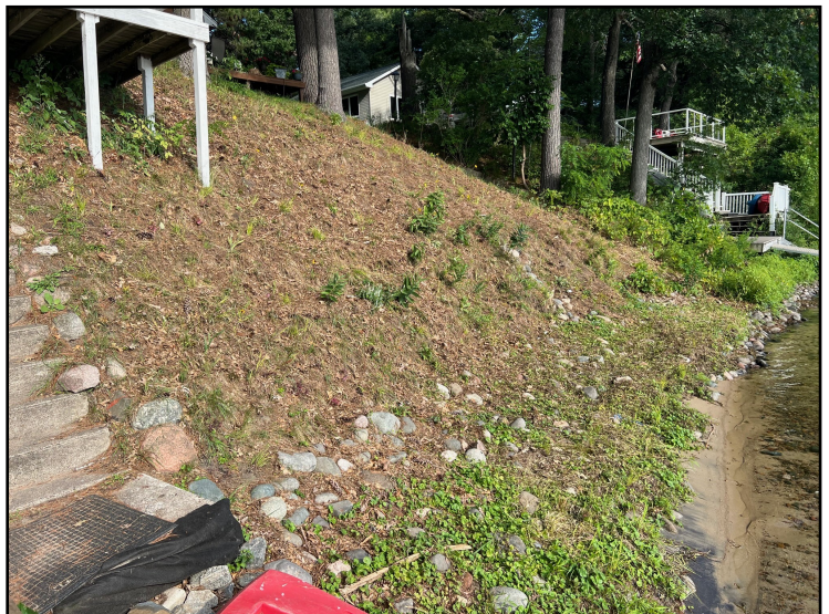
1050 native plants installed to uptake nutrients and improve wildlife/pollinator habitat.