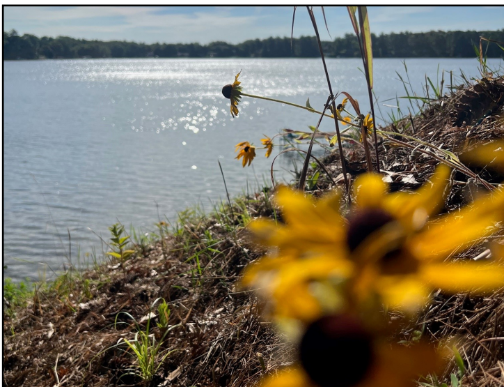
1050 native plants installed to stabilize hillside and shoreline to prevent erosion.