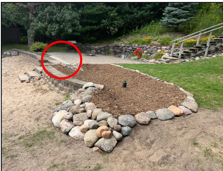
Trench grate installed to divert stormwater to raingarden.