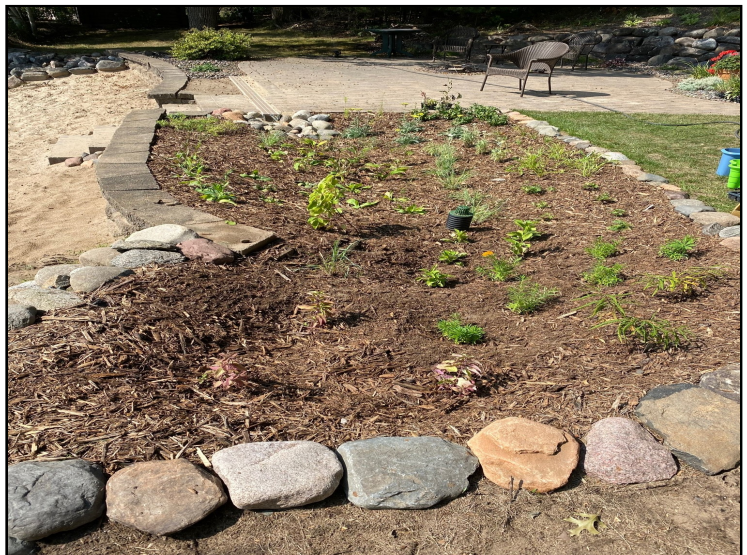
180 native plants installed to uptake nutrients and improve wildlife/pollinator habitat.