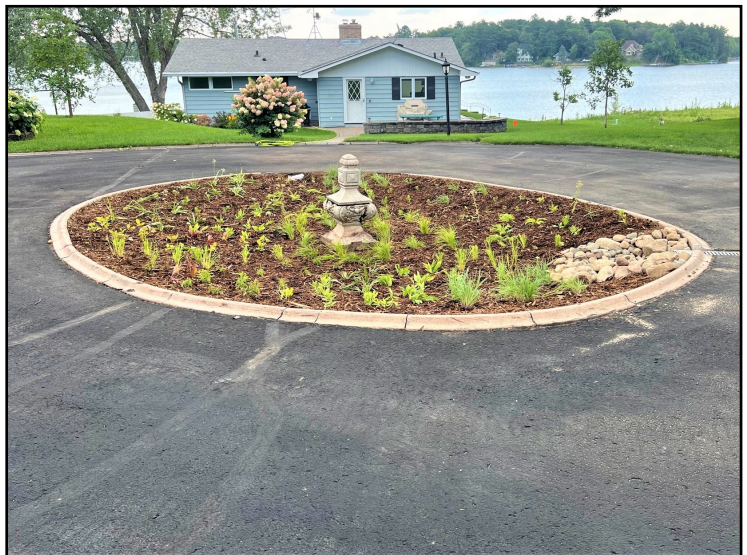
250 native plants installed to uptake nutrients and improve wildlife/pollinator habitat.