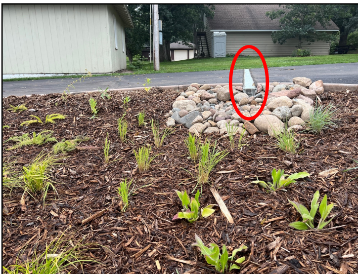
Trench grate installed to divert stormwater to raingarden.