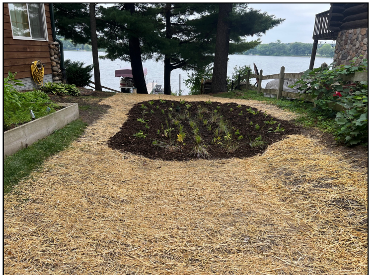
80 native plants installed to uptake nutrients and improve wildlife/pollinator habitat.