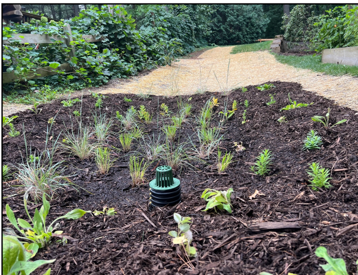
108 sqft raingarden to capture and filter rainwater